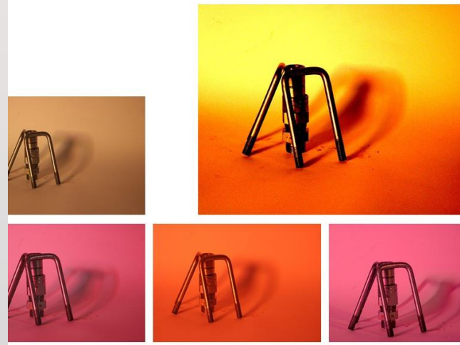
Deklan Mantion — Still life series

P&C Fundraiser Masks for Sale Great 3D Contour Face Masks (black with a small white AHS logo) are now available from the school office for $10 each. For any other details please contact: alstonvillehs.pc@gmail.com