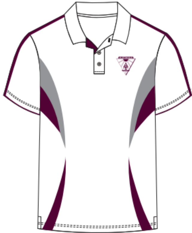
Senior Unisex Polo