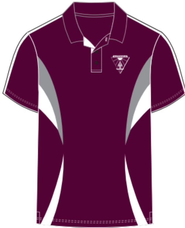
Junior Unisex Polo